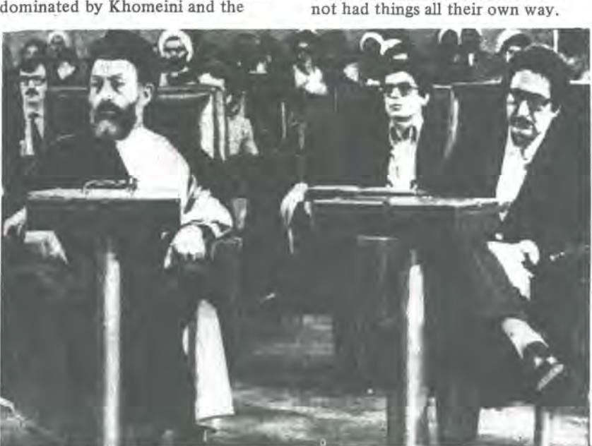
Ayatollah Beheshti and President Bani Sadr at the opening of the Iranian Parliament

Ayatollahs Beheshti, Khalkhali and Co. The mullahs are armed with a reactionary utopian ideology based on Shiite Islam and a demagogy aimed at the small bazaaris, merchants. artisans and the massive sub-proletariat the moustazzifin. They have been able to dominate the masses and block bourgeois normalisation and economic reconstruction and prevent the proletariat and the popular democratic forces (the nationalities in particular) from seizing power and expropriating the bourgeoisie But even the immensely influential Imam and the sinister Ayatollah Sayyed Mohammed Beheshti have